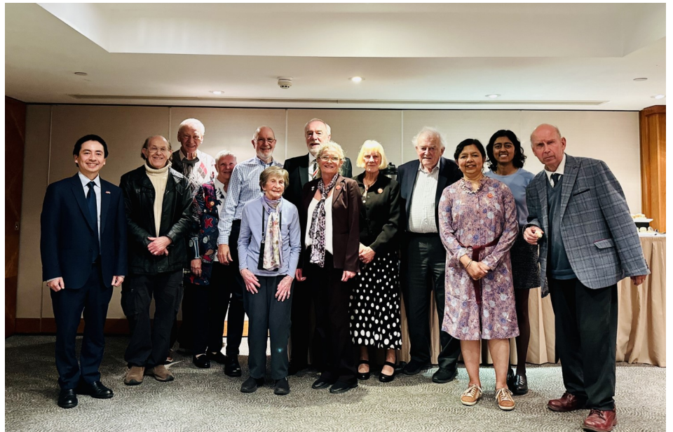
The Trustees with some of the charity's supporters at the Annual General Meeting held in June.