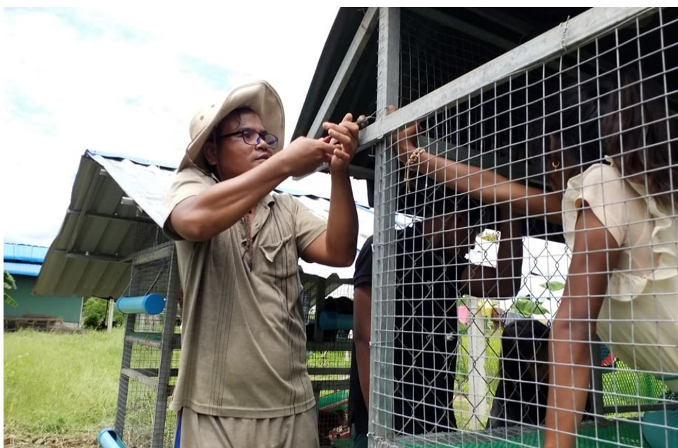
Below: The new chicken shed.