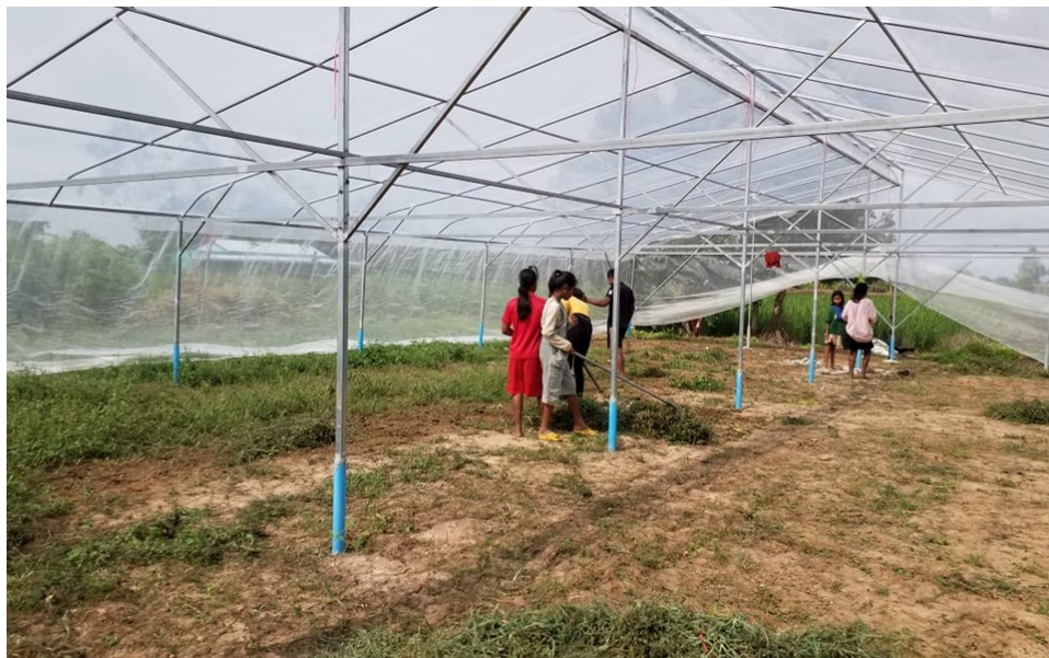
Above: Building the giant greenhouse.

In providing the initial funding to purchase the greenhouse, seeds, and a chicken house, the Trustees are encouraging a sustainable future, both for the Home and for the children who live there.